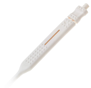
Ergonomical handle with defined breaking point